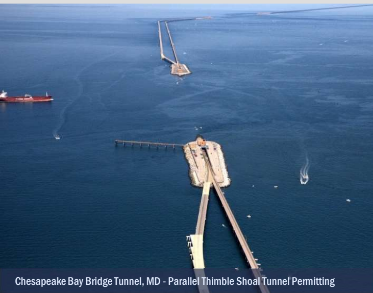
Chesapeake Bay Bridge Tunnel, MD - Parallel Thimble Shoal Tunnel Permitting