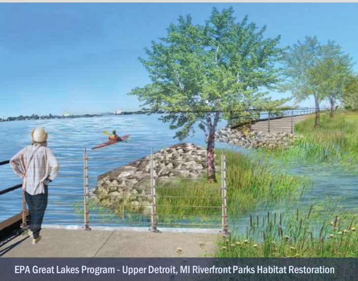
EPA Great Lakes Program - Upper Detroit, MI Riverfront Parks Habitat Restoration